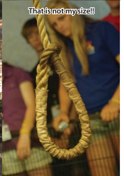
That is not my size!!