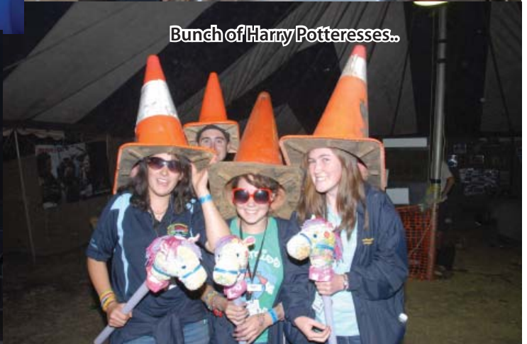
Bunch of Harry Potteresses..