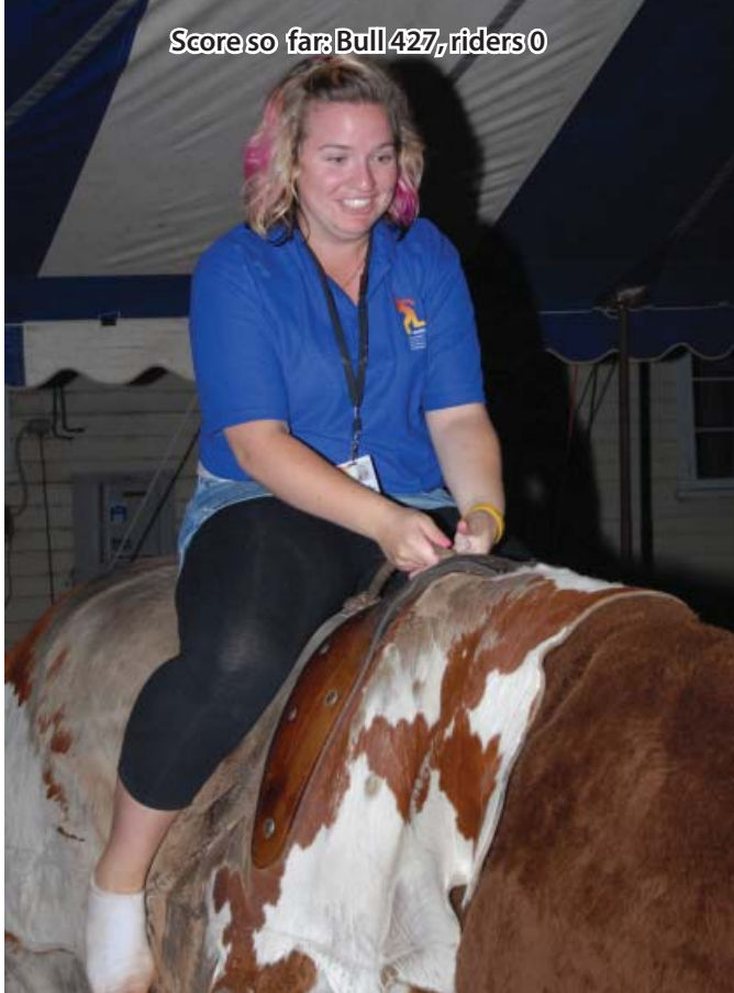
Score so far: Bull 427, riders 0