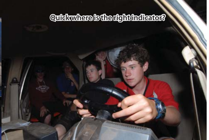
Quick where is the right indicator?