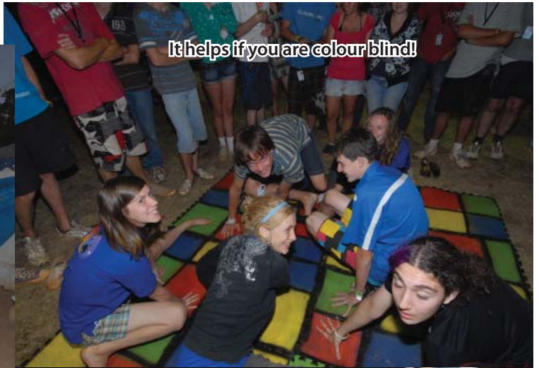
It helps if you are colour blind!