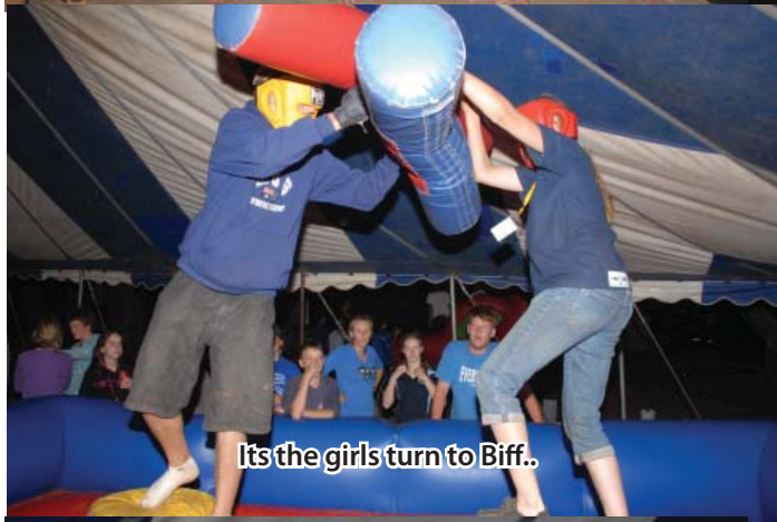
Its the girls turn to Biff..