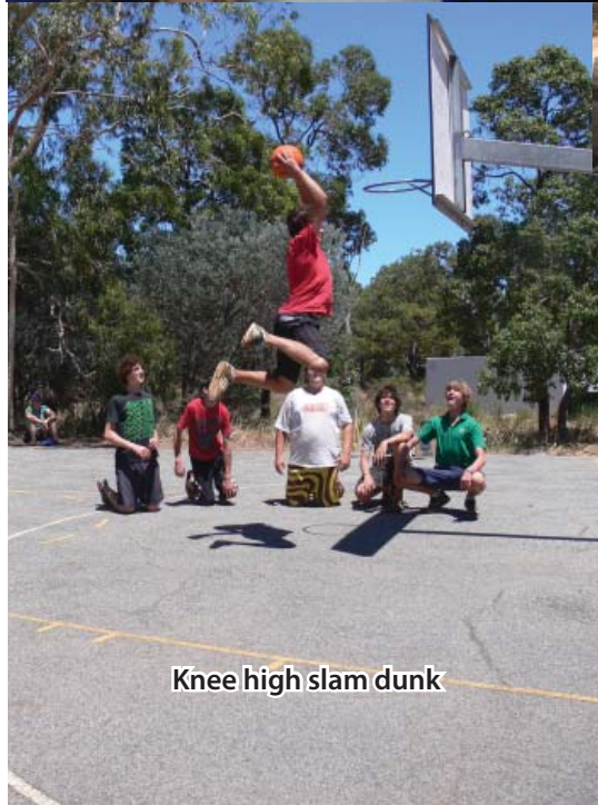
Knee high slam dunk