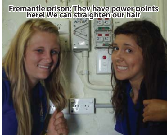
Fremantle prison: They have power points here! We can straighten our hair