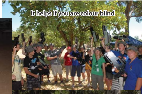
It helps if you are colour blind