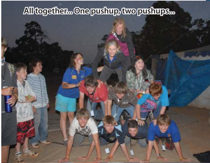
All together... One pushup, two pushups...