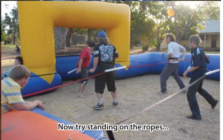
Now try standing on the ropes...